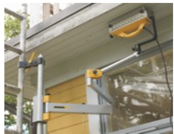
Speedheater Arm Pro