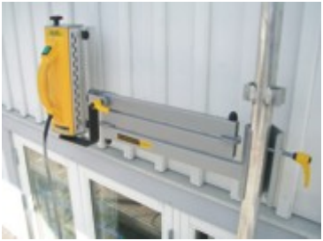
Speedheater Arm Classic